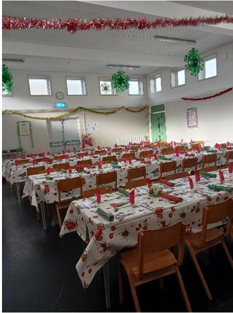
All ready for Christmas Day